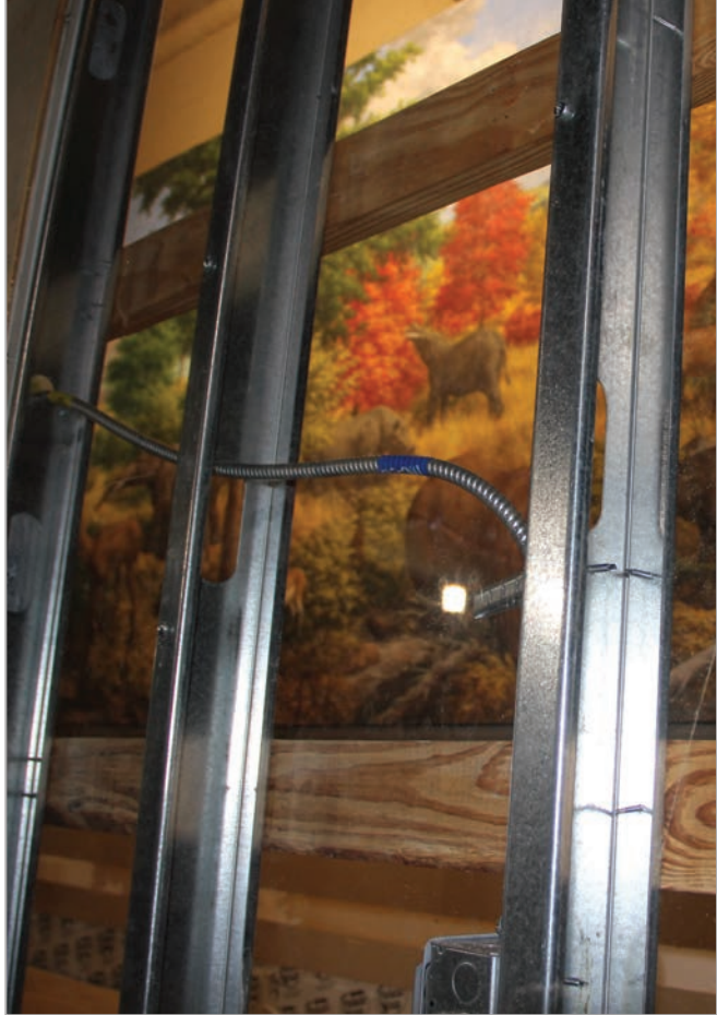
A historic mural depicting a prehistoric landscape is seen through steel beams erected as part of the Peabody Museum renovation project.