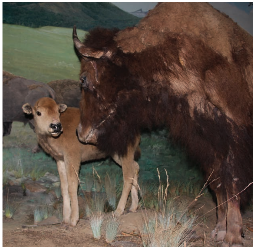
An American bison appears to graze beside its calf in the short grass plains of the West, one of the historic dioramas at the Peabody Museum.

By late last summer, the 1920s building had been pared back to its studs. Special protective walls were built around the dioramas and two historic murals—the Age of Reptiles and the Age of Mammals—that will connect the Peabody's past as a groundbreaking physical science museum to its future as an institution with more classrooms, more light and more display space.