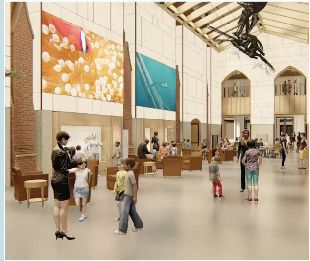
Two renderings show what the new Peabody museum will look like. Images provided by Reigh & Petch Design International / Centerbrook Architects and Planners