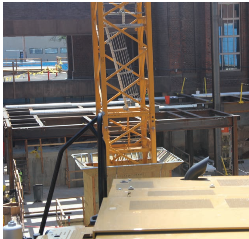
As the Peabody is being rebuilt from the inside out, former exhibit halls are filled with scaffolding, beams and construction equipment.