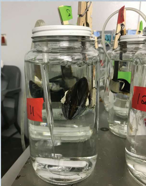
Top: A mussel is immersed in water laden with microplastic particles in a lab at UConn Avery Point.