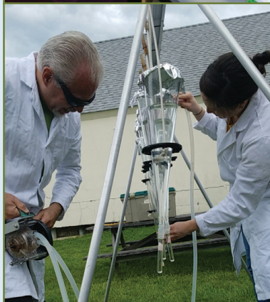
Top: The “Plastic Free Seas” exhibit at the Mystic Aquarium showcases plastic alternatives as well as the problems created by plastics.