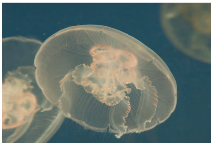
Moon jellies are the most common type of jellyfish found in Long Island Sound.

On September 12, 1979, a half-century after he descended the conning tower at New London, Teale posed a seemingly simple question to an audience