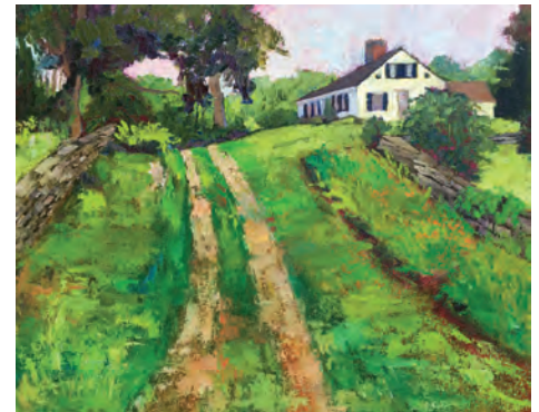
"Coming Home," painted by Roxanne Steed as part of the Connecticut Audubon Society's Artist-in-Residence program at Trail Wood, shows the Teale home in July 2015. Used with artist's permission