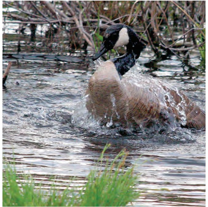
Above, a nesting Canada goose bathes in the slow-water section of Blackwell Brook above the Elliot Road bridge.