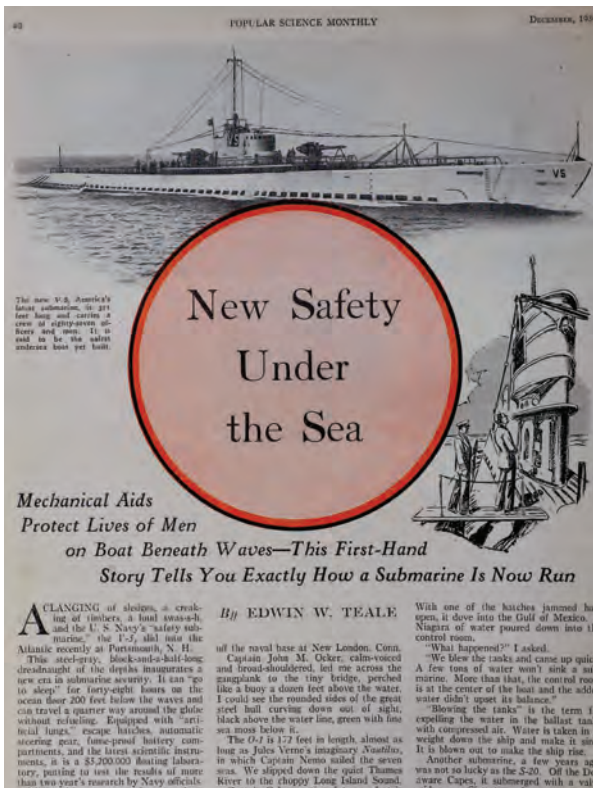
The opening page of Edwin Way Teale's December 1930 article on submarine safety, published in Popular Science Monthly.

of philosophers: "What is a lifetime?" Diagnosed with prostate cancer in 1974, he had been given six months to live. A slow-growing cancer elongated six months to six years, but, by the fall of 1979, as he spoke to The School of Philosophy in Concord, Mass., Teale knew his time was waning. To his typed notes, he added a private subscript: "My Last Lecture." In it, he argued that life's value lay largely in deriving meaning and pleasure from simple things, particularly those in nature. He returned again to that submarine ride in Long Island Sound. "The thing I remember most vividly," he told his audience, many of them long-time friends, "is the scores of jellyfish, pale yellow and shining in the backlighting, swirling past like butterflies. Here, too, I was obtaining my pleasure from simple things." Forty years later, we, too, can gather pleasure and meaning from such simple things in nature, but increasingly, exponentially, we threaten these simple things – and the complex, fragile systems they inhabit – through pollution in all forms on all scales: in Long Island Sound, in the greater Atlantic, in all the world's waters, in our own backyards.